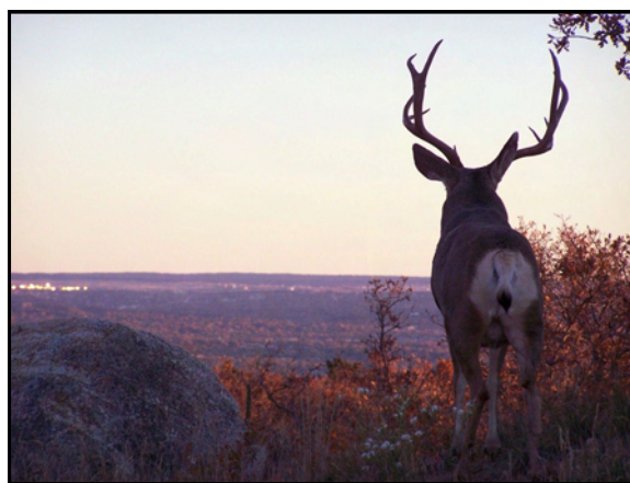
King of the Mountain