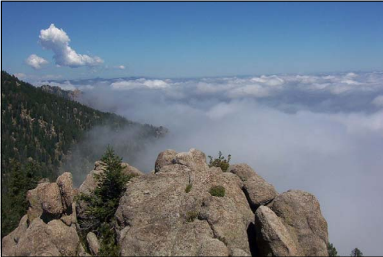
A view from the top of Cheyenne Mountain; soon we can all enjoy this wonderful panorama