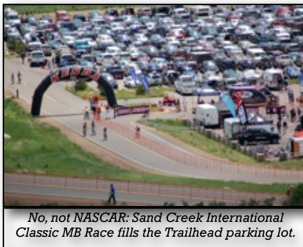
No, not NASCAR: Sand Creek International Classic MB Race fills the Trailhead parking lot.

Why are these successes important? Because they bring needed revenue to the Park, and they bring superb coverage of this great resource to folks across not just Colorado but also the nation. It is no secret that Colorado is facing tough times with the State budget. Our Park is taking funding cuts just as most of the rest of state enterprises are. Some of those cuts are painful...putting support of programs and Park staffing at risk.