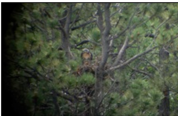
Our Red-tail Fledgling on the Nest

several week-old fledgling. The second is an impressive Golden Eagle aerie located on a rock-face at the southwest end of the park. Here the group sets up their scopes to observe the parents in nest-building, feeding rituals, and eventually the fledging of their youngster.