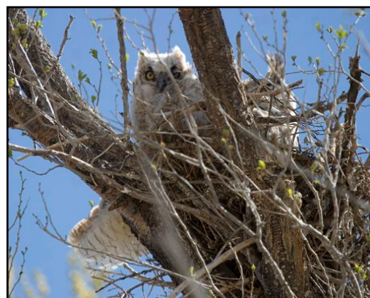
A Great-horned Owl relaxes on the nest