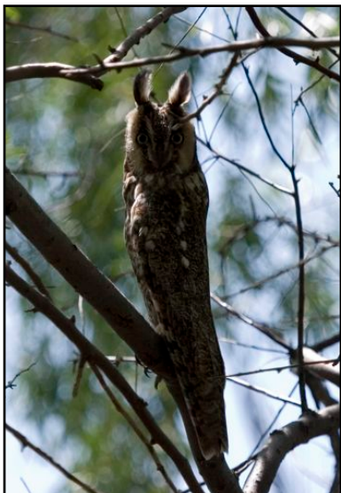
Long-eared Owl listens for his supper

One of the most popular volunteer-led programs at Cheyenne Mountain State Park is our Raptor Monitoring Program which has been active since March 2006. Sanctioned by the Colorado State Parks Resource Stewardship Program, "raptor monitoring gives useful tools to a land manager to assist in stewardship and decision-making. Raptors are a keystone predator – an animal without which the ecosystem would fail. The functioning of the Park ecosystem is dependent on raptors. Some raptors, such as Golden Eagles and Northern Harriers, are also an indicator species and by monitoring the presence of birds and nests, a clearer picture is drawn of the overall functioning of the system." (source: Colorado State Parks Raptor Monitoring Handbook )