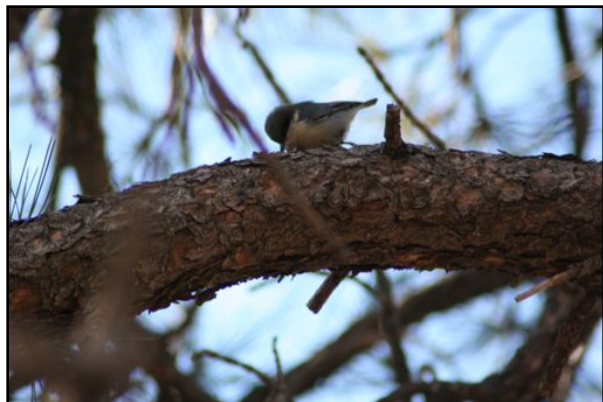
Black-capped Chickadee Hunts Down a Few Morsels