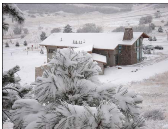
Winter Finds a Temporary Home at Our Visitors Center

Hello, Friends! I hope this newsletter finds everyone in good health and high spirits! After experiencing what I would call a true example of wintertime in Colorado these past few months, it seems that everyone is stir crazy and anxious for spring to arrive. We look forward to the throngs of visitors good weather will bring!