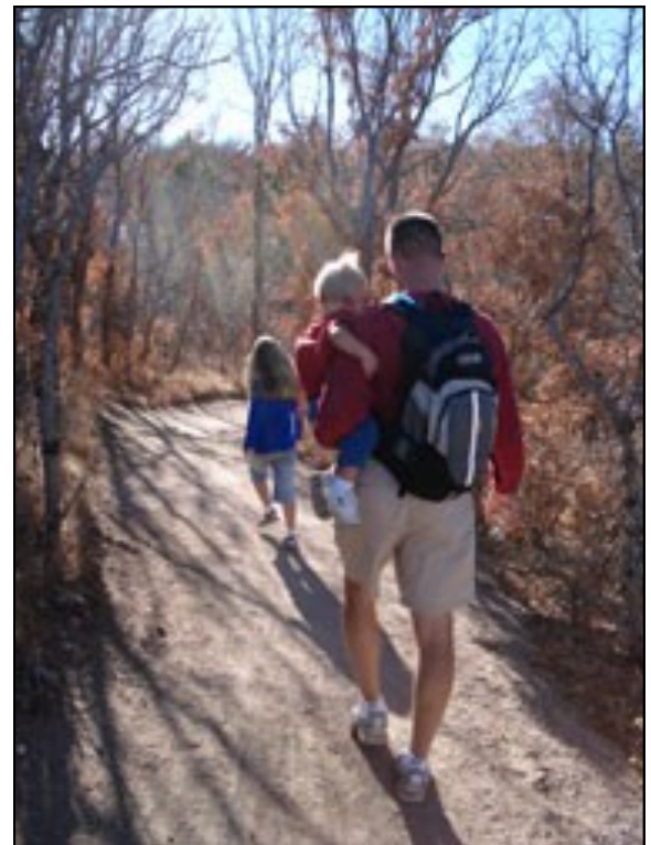
A Walk in the Park!

Just email any of the Board members. Our standing committees (Finance, Communications, Membership, and Programs) are always on lookout for folks who want to get involved and make a difference.