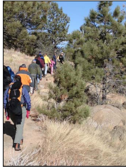
Trail Crew Heads Out in Search of Work

As the weather warms and improves, the volunteers will also bring back one of their more popular programs from last summer. That's right, Trail Work Days are on the horizon. The first opportunity, weather permitting, will be Saturday, April 26. May's date is Saturday, the 31st. Then in June we'll add a new twist: on Wednesday, June 4 and 25, we'll have After-Work Trail Days, running from 5:00-8:00 PM, with food to follow! Saturday, June 21, we'll greet summer with another Trail Work Day from 8:00 AM until 3:00 PM. Dig up those work boots, gloves, and a hardy lunch and join us as we make a visual impact at the park.